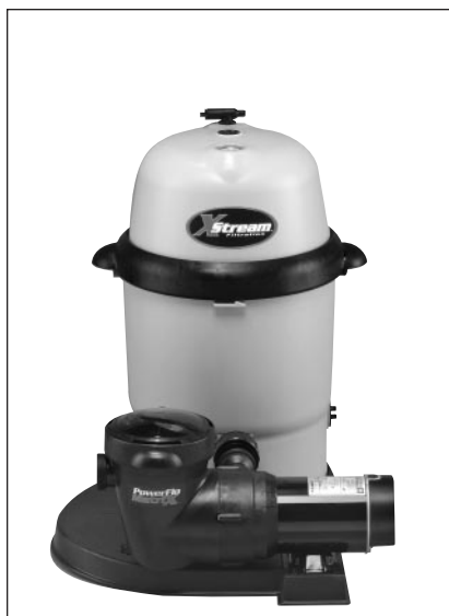
CC10092S XStream Filtration Series