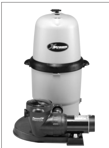
CC15093S XStream Filtration Series