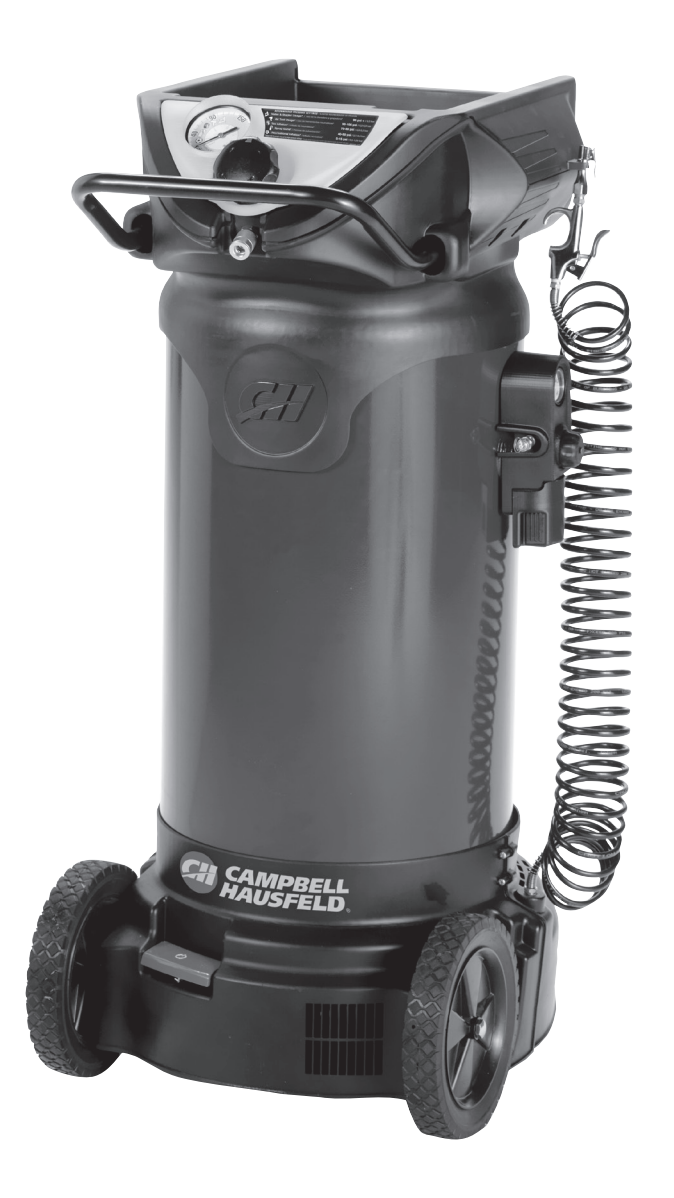
Figure 1 - WL6701 and WL6703

Oilless compressors are designed for do-it-yourselfers with a variety of home and automotive jobs. These compressors power spray guns, impact wrenches and other tools. These units operate without oil.